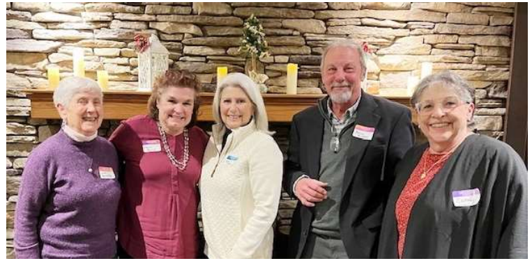
Winter Gathering Event Organizers