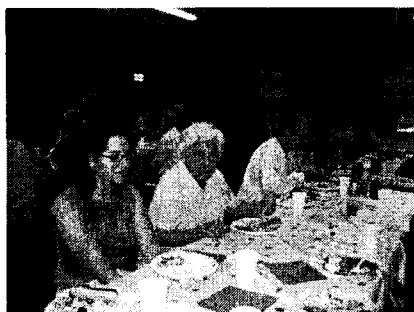
BNA Picnic in South Lodge, Ellison Park