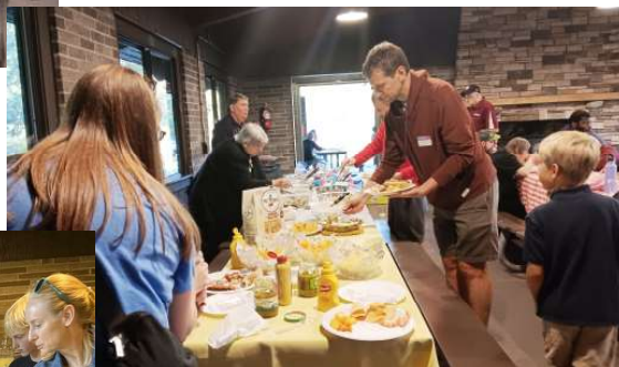
Help Yourself to Lots of Great Dishes