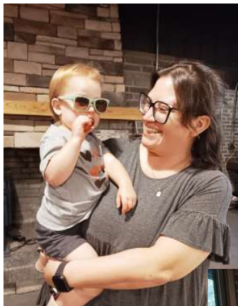
Cool Kid from Quentin