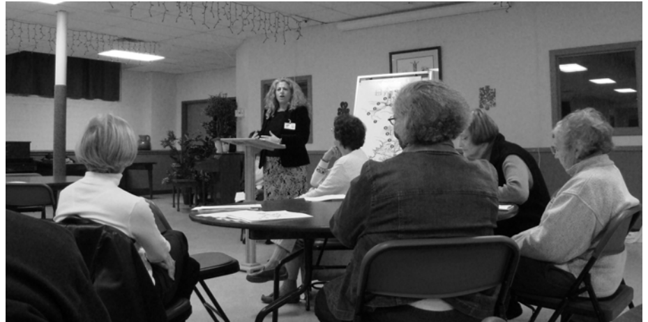
Home For A Lifetime Safety Tips seminar held March 18th provided neighborhood attendees with many useful tools to ensure a safe home environment with the help of the Jewish Community Center.

Many thanks to those who have returned their Home Maintenance surveys for the recommendations and well annotated entries. This information will serve us well as we strive to remain in our homes, maintain the quality of our Browncroft residences and neighborhood.